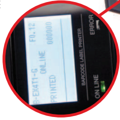
User-friendly front panel for easy operation and status reporting with helpdesk

Reliability and performance usually come at a cost but, with the B-EX series, premium capabilities come as standard, essentially lowering initial capital outlay and future-proofing your investment.