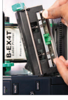
Snap-in printhead reduces maintenance downtime to a minimum

The unique intuitive graphical LCD 'helpdesk' display improves usability and prompts even the novice user to take immediate corrective action where necessary, keeping user training to a minimum.