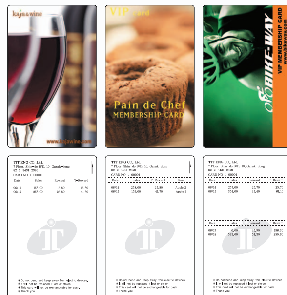
Sample PET Cards